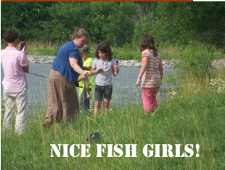
NICE FISH GIRLS!

This year we experienced the best River to River Expedition in our history. The trip was exciting and the number of campers was fantastic! The amount of returning campers that brought friends was remarkable. The Camp D Expeditionary Team reached the summit, after 14 days, amid very severe and even life threatening weather to reach the peak which was above the clouds and the storm....truly awesome!