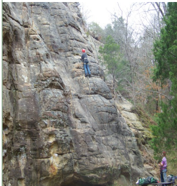
NATE THE GREAT!