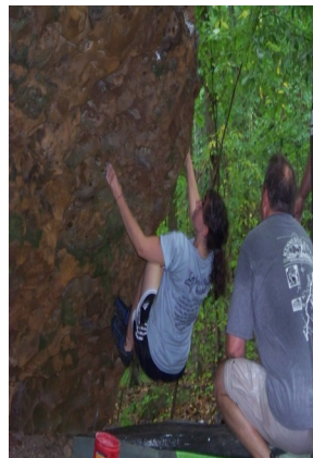
Family Bouldering Expedition

California Desert Expedition Dec 26-Jan 2